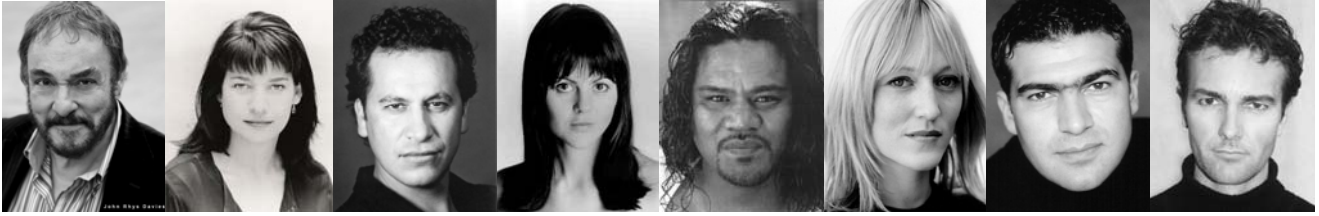
Captions at end of Press Release

A stellar Cast in Kiwi Horror Movie currently in Production